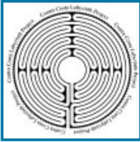
A Tool For Community Healing